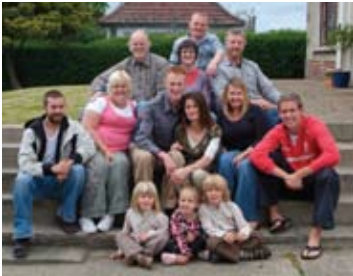
Christian Family Centre, Armoy

Legacurry Presbyterian Church also supports: